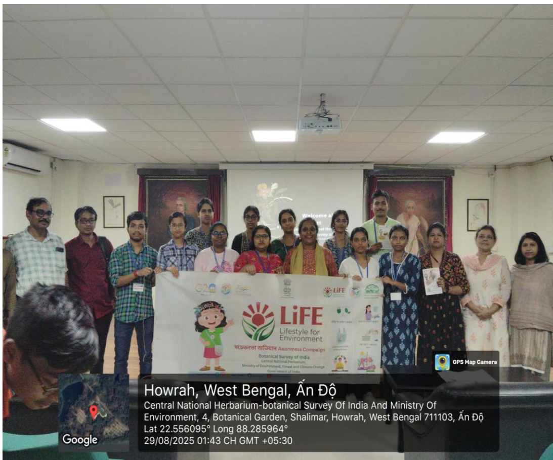
Howrah, West Bengal, Ấn Độ Central National Herbarium-botanical Survey Of India And Ministry Of Environment, 4, Botanical Garden, Shalimar, Howrah, West Bengal 711103, Ấn Độ Lat 22.556095° Long 88.285964° 29/08/2025 01:43 CH GMT +05:30