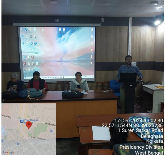
Some Glimpses of Constitutional Values And Fundamental Duties (CVAC) Orientation Programme