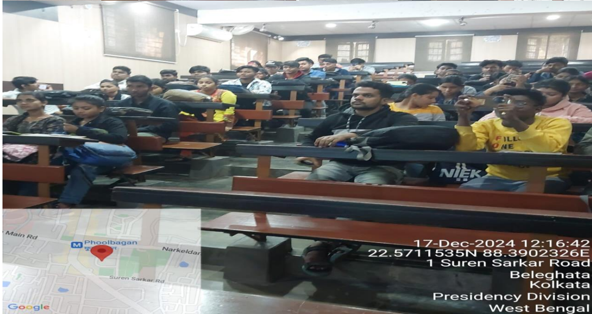
Some Glimpses of Constitutional Values And Fundamental Duties (CVAC) Orientation Programme